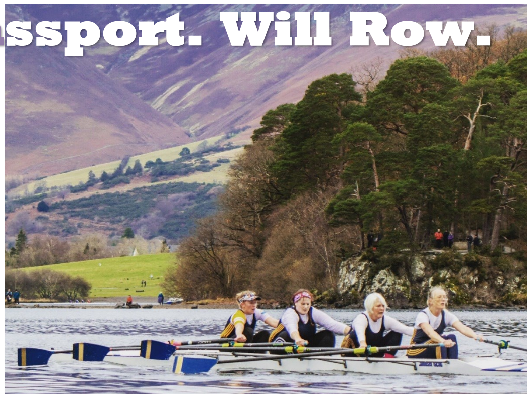
Racing on Derwentwater, Lake District, with DARC in 2019

The city of Durham surrounds a horseshoe bend in the River Wear (rhymes with “here”), water watched over by the eleventh-century Durham Castle and Cathedral, today forming a UNESCO World Heritage Site. A little over two kilo-