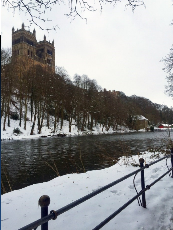
Above: The River Wear and Durham Cathedral Right: A DARC crew racing through Elvet Bridge, Durham

rowing facing backward in absurdly narrow boats, people who come from Alaska or Canada or Wales or South Africa and have found themselves rowing in Durham.