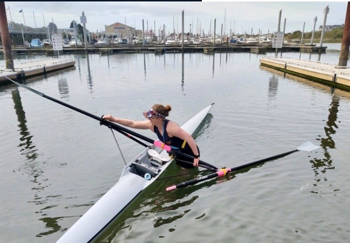
Above: Putting the Peinert into the water in Brookings, Oregon, 2021 Right: Rowing on Sand Lake, Anchorage, Alaska in 2020

Bridges are a key part of my story of rowing in Durham—not just because of the night where it nearly went terribly wrong, but because of my