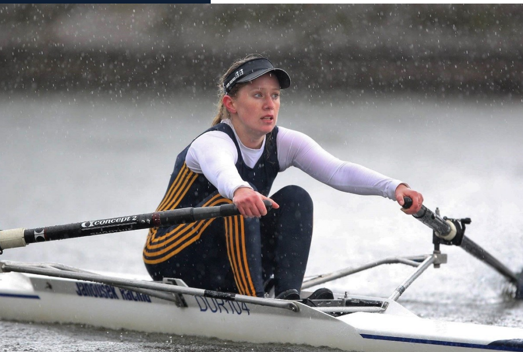
First race on the Ouse in York, 2016

offer a few words of advice: watch out for the pelicans; don't even think about rowing past the bridge during low tide; get used to wading through tons of seaweed; and challenge the local fishing boats to races only if you feel like